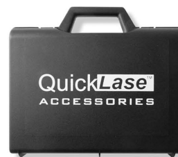
Laser Accessories Kit - Code: QWLACC