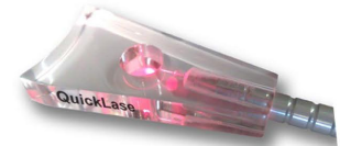
Laser Whitening prism - Code: QWLWHITE