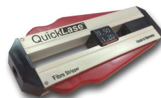
Fibre Stripper - Code: QWSTRIP