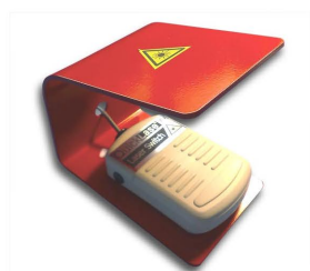
Foot switch guard - Code: QWGUARD