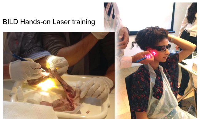
BILD Hands-on Laser training