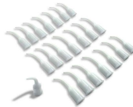
Stripable fibre disposable tips - Code: QWTIPS