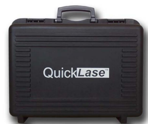
Desktop laser case - Code: QWLCASE