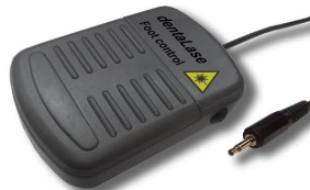
Footpedal - Code: QWPEDAL