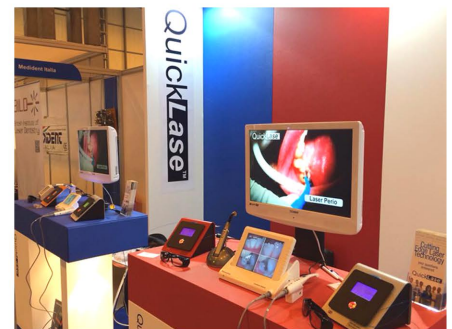
Dental trade shows and seminars