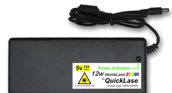
Power Supply - Code: 12W5VAPSU