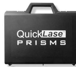
Laser Prisms Kit - Code: QWLPRISMS