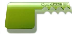
Protective laser shield - Code: QWSHIELD