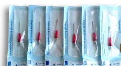
Disposable bendable fibre tips - Code: QWDISTIPS