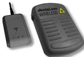
Wireless footpedal - Code: QWPEDALW