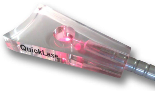
Laser Therapy Prism