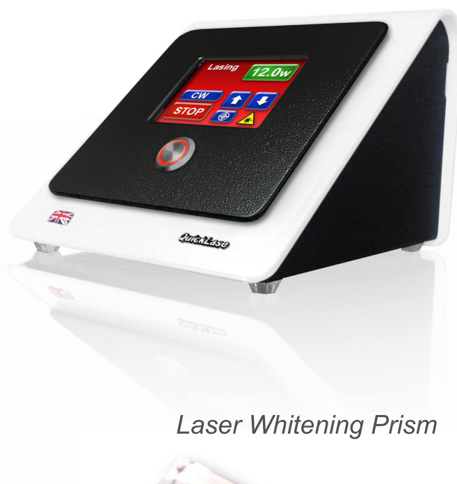
Laser Whitening Prism