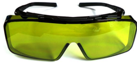
Dentist/Nurse DUAL - Code: QWGLASSDdual