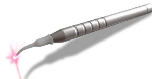
All-in-One handpiece - Code: QWHPIECE