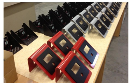
QuickLase manufacturing facilities